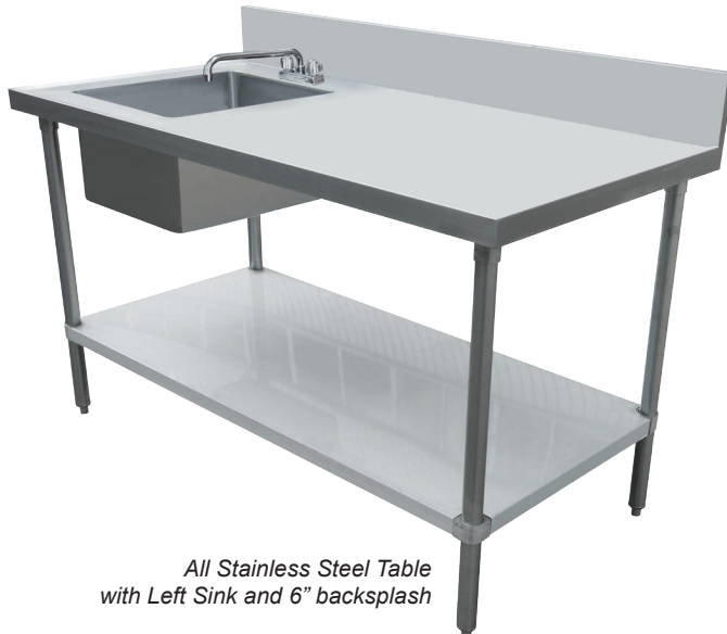
All Stainless Steel Table with Left Sink and 6" backsplash